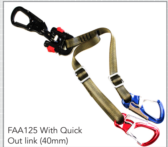
FAA125 With Quick Out link (40mm)