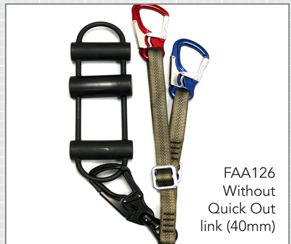
FAA126 Without Quick Out link (40mm)